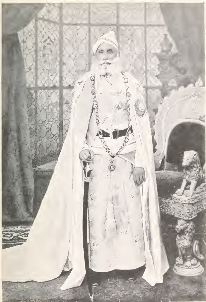
His Highness the Maharana of Udaipur, G.C.S.I., G.C.I.E.