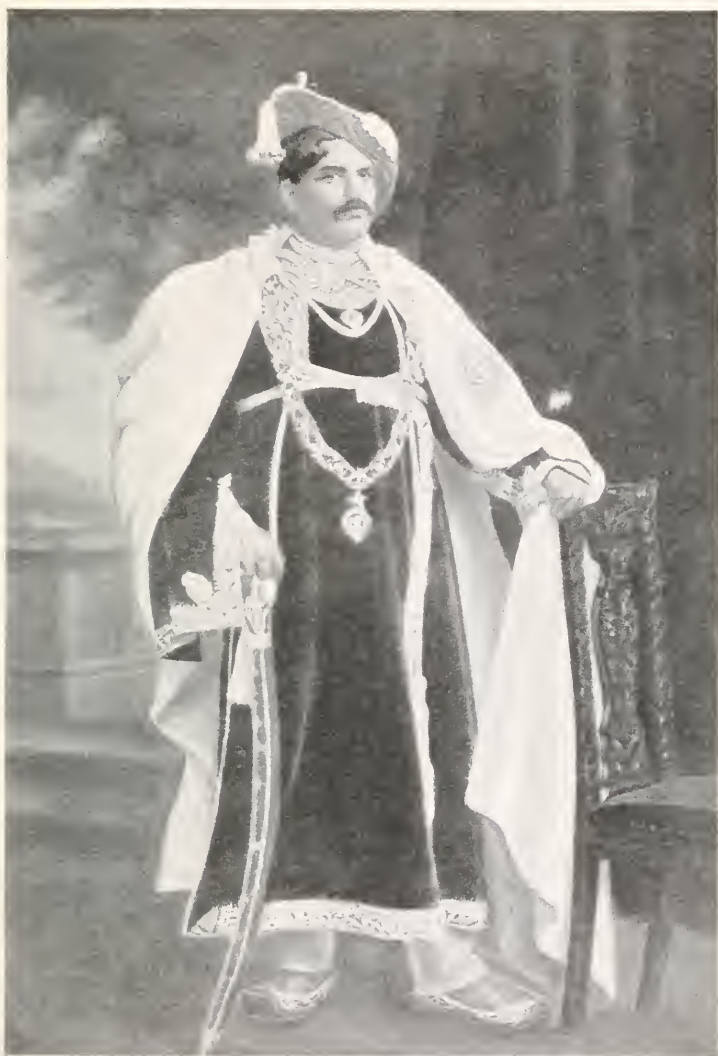
His Highness the Maharaja of Kolhapur, G.C.S.I., G.C.I.E., G.C.V.O., LL.D.