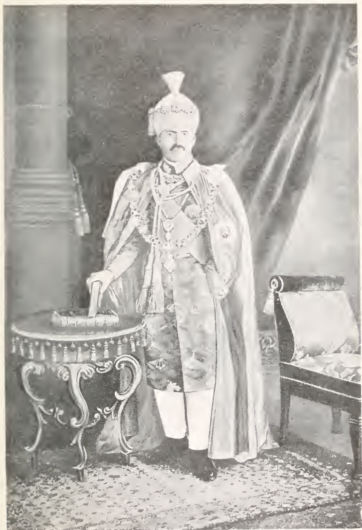
His Highness the Nizam of Hyderabad, G.C.S.I.